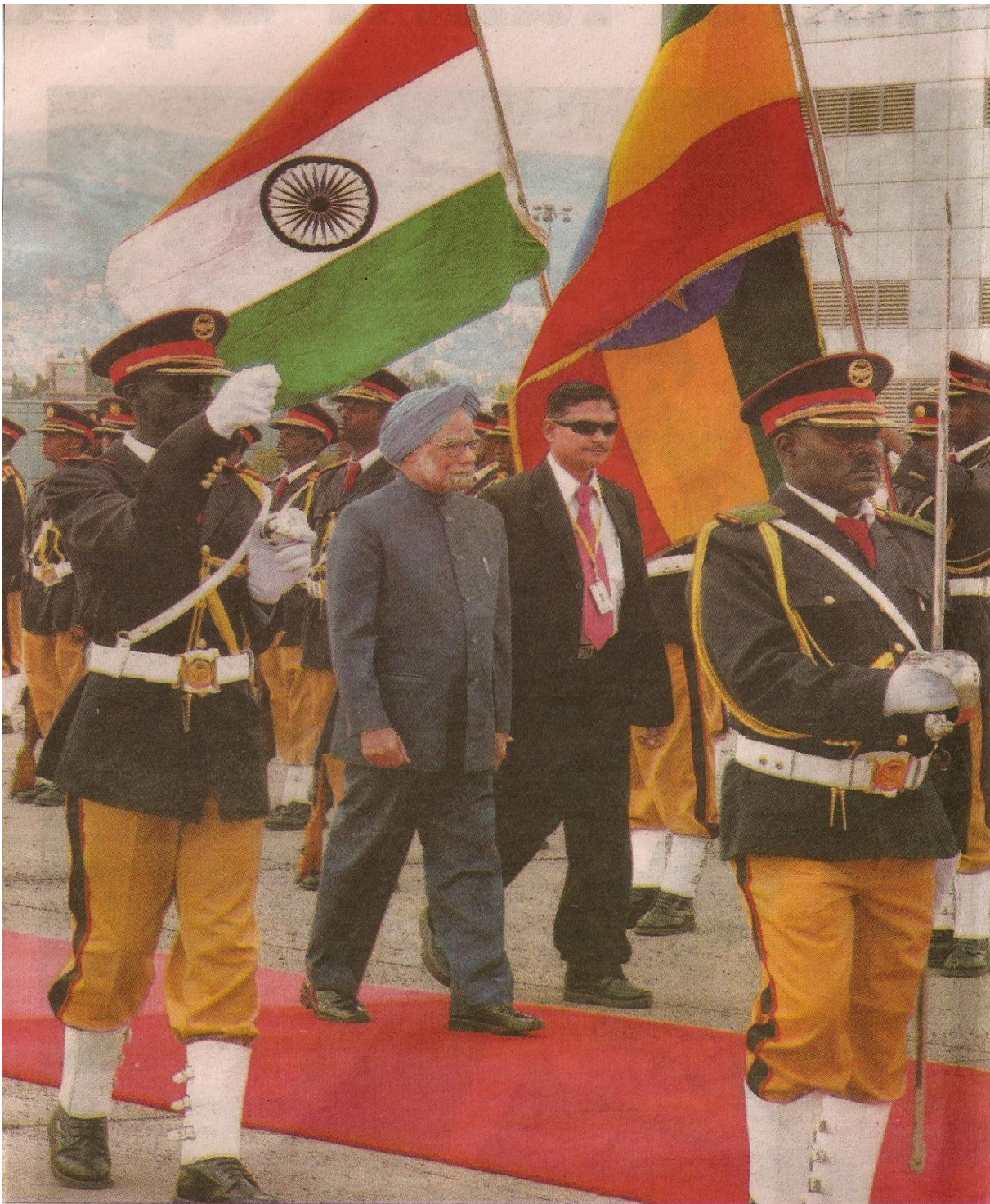
Indian Prime Minister Manmohan Singh (centre) in Addis Ababa.